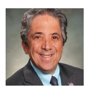
Senator JOHN KEFALAS