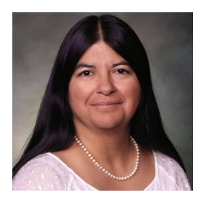
Senator IRENE AGUILAR