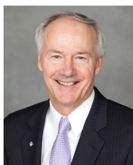
Governor Asa Hutchinson

Arkansas Governor Asa Hutchinson has said he is interested in how an innovation waiver can play a role in the future of the private option.